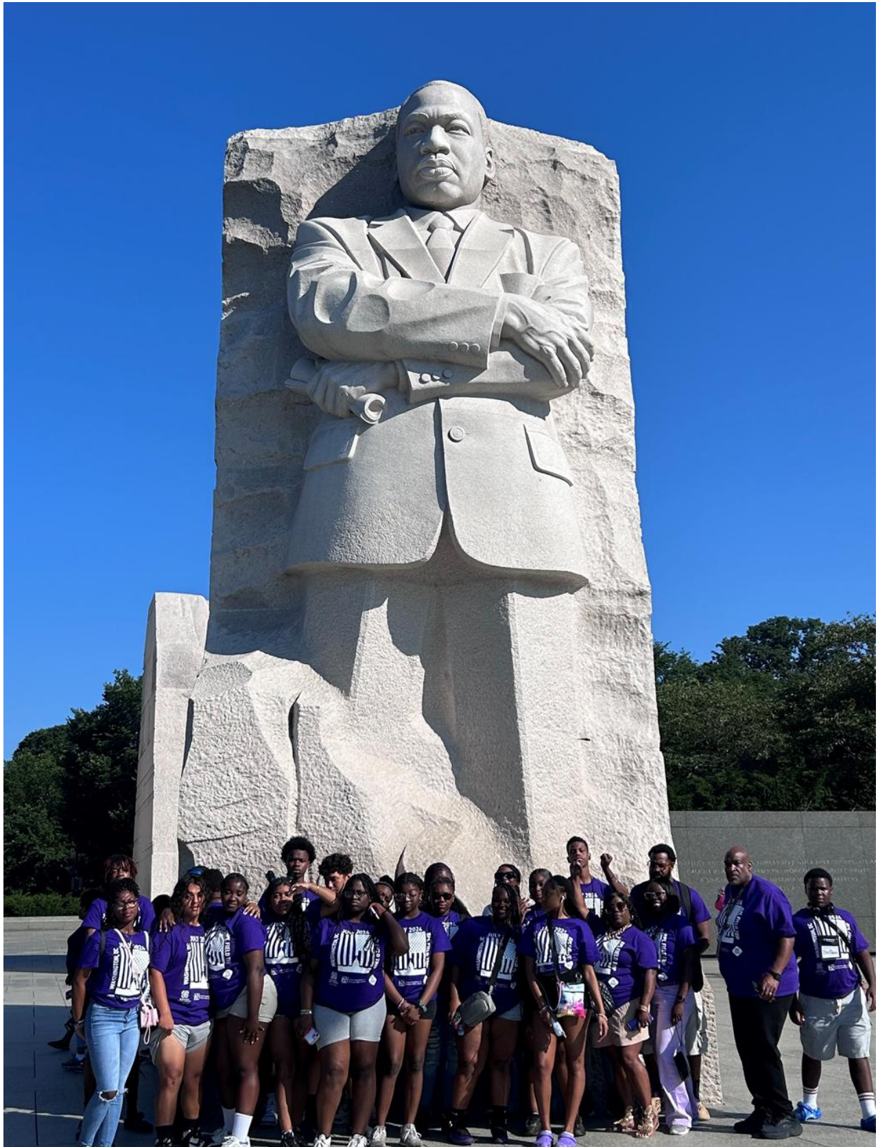
FFRPL funded the Safe to be Smart youth trip to D.C. (July 2024) through generous support from donors, the Konar Foundation, and Reynolds Library.