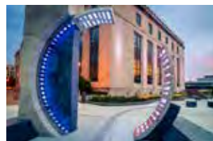
Photos of the Terrace

The Genesee Valley Branch of the American Public Works Association (APWA) named the City of Rochester the 2022 recipient of the Project of the Year Award in the Structures $5-25 Million Dollar Category for the ROC the Riverway: Rundel Memorial Library North Terrace Improvement Project . The Rundel Terrace project also won the 2022 Reshaping Rochester Award for Design (in the "Large Project" category) given by the Community Design Center of Rochester.