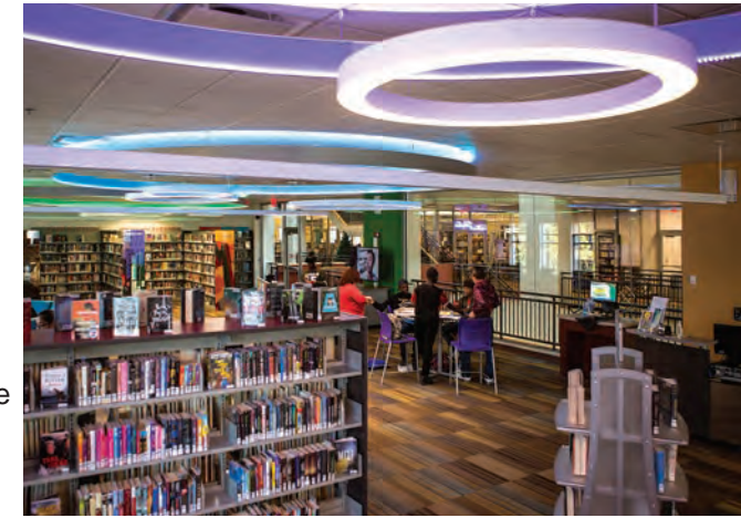
New Teen Central

With supplemental funds raised by FFRPL, the Rochester Public Library renovated about 16,000 square feet of space at Central Library in the Arts Division and about 11,000 square feet of space dedicated to Youth Services ( Teen Central, B Hive, and Middle Ground ).