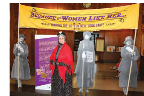
'Susan B. Anthony' at Central Library

FFRPL supported the 2017 Central Library exhibition, 'Because of Women Like Her... Winning the Vote in New York State' through grants, gifts and the Becker Fund for Local History. More than 28,000 visitors learned about the history of the women's suffrage movement, and traveling versions have been seen by thousands more throughout Monroe County.