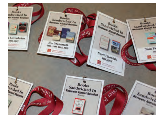
Books Sandwiched In 60th Anniversary

Last year, FFRPL celebrated 60 years of its legacy program Books Sandwiched In , and welcomed 40 BSI alumni reviewers to celebrate a yearlong look back at six decades of noon-time book reviews. More than 1000 people attended the Spring and Fall BSI series (with hundreds more viewing remotely on YouTube and social media).