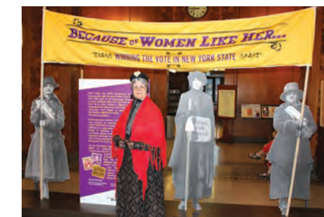
'Susan B. Anthony' at Central Library

FFRPL supported the 2017 Central Library exhibition, 'Because of Women Like Her... Winning the Vote in New York State' through grants, gifts and the Becker Fund for Local History. More than 28,000 visitors learned about the history of the women's suffrage movement, and traveling versions have been seen by thousands more throughout Monroe County.