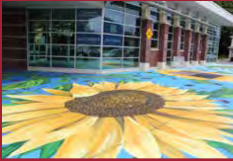
Sully StoryWalk at the Ryan R-Center