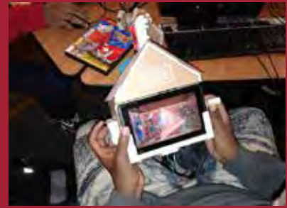
Safe to be Smart event at Arnett

In FY 2018-19 fundraising and planning continued for the Downtown Central Library's Rundel Terrace Revitalization Project . Construction is slated to begin in Spring 2020, with art installations to be completed Spring 2021. The Project will transform a long-closed area into a new park-like public riverfront terrace, designed with spaces, pathways and seating for engagement, education and reflection. As one of the first sites developed for ROC the Riverway , the city and state have committed nearly $7-million for repairs and maintenance underneath the terrace, plus a large scale site-specific public artwork for the corner of Broad Street and South Avenue. FFRPL raised $125,000 for a complementary art installation, 'The River Revealed,' with additional design and sculptural elements serving as an outdoor educational area. Your donations helped us raise $8200 through our online fundraising campaign, which was matched with a $4000 grant from USA Today Network's A Community Thrives initiative.