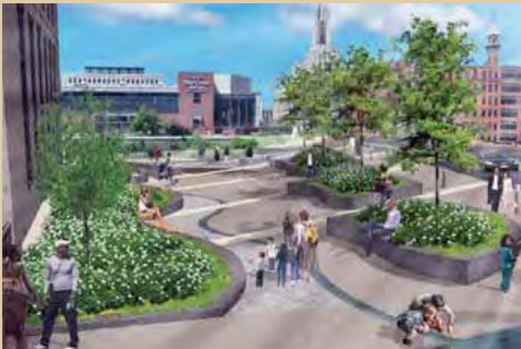
Rundel Terrace Revitalization Project renderings

In FY 2018-19 fundraising and planning continued for the Downtown Central Library's Rundel Terrace Revitalization Project . Construction is slated to begin in Spring 2020, with art installations to be completed Spring 2021. The Project will transform a long-closed area into a new park-like public riverfront terrace, designed with spaces, pathways and seating for engagement, education and reflection. As one of the first sites developed for ROC the Riverway , the city and state have committed nearly $7-million for repairs and maintenance underneath the terrace, plus a large scale site-specific public artwork for the corner of Broad Street and South Avenue. FFRPL raised $125,000 for a complementary art installation, 'The River Revealed,' with additional design and sculptural elements serving as an outdoor educational area. Your donations helped us raise $8200 through our online fundraising campaign, which was matched with a $4000 grant from USA Today Network's A Community Thrives initiative.