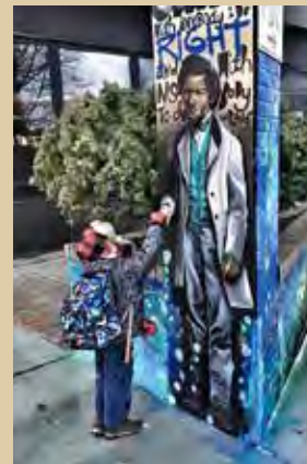
Frederick Douglass Community Library