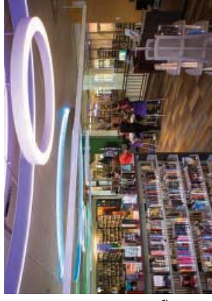
New Teen Central

FFRPL raises funds, presents programs, supports special projects, and purchases supplemental materials and equipment for the Rochester Public Library.