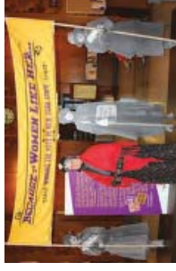
'Susan B. Anthony' at Central Library

FFRPL supported the 2017 Central Library exhibition, 'Because of Women Like Her... Winning the Vote in New York State' through grants, gifts and the Becker Fund for Local History. More than 28,000 visitors learned about the history of the women's suffrage movement, and traveling versions have been seen by thousands more throughout Monroe County.