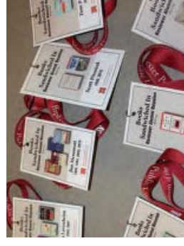
Books Sandwiched In 60th Anniversary

Last year, FFRPL celebrated 60 years of its legacy program Books Sandwiched In , and welcomed 40 BSI alumni reviewers to celebrate a yearlong look back at six decades of noon-time book reviews. More than 1000 people attended the Spring and Fall BSI series (with hundreds more viewing remotely on YouTube and social media).